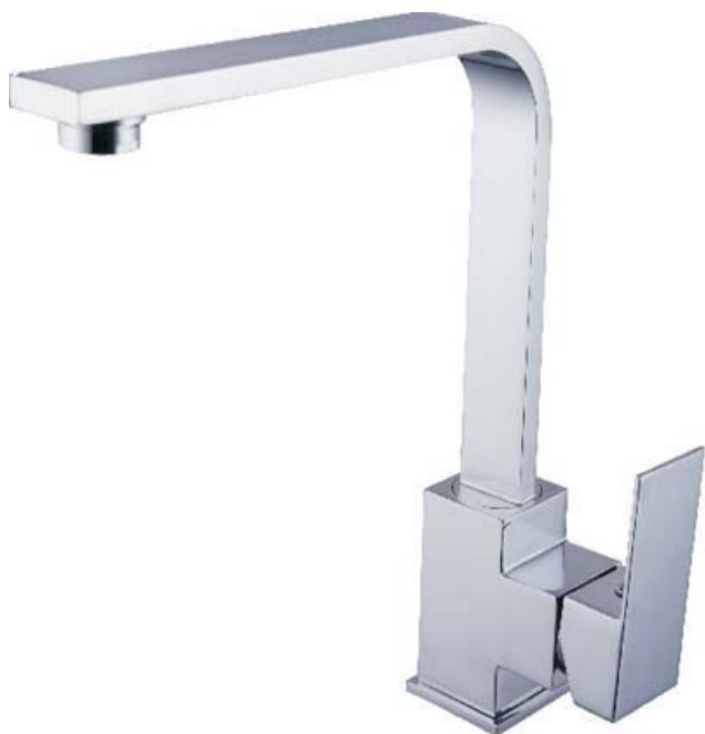
TNK1 Tony Sink Mixer - Chrome