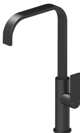
PBS1001MB - RUKI Sink Mixer - Matt Black