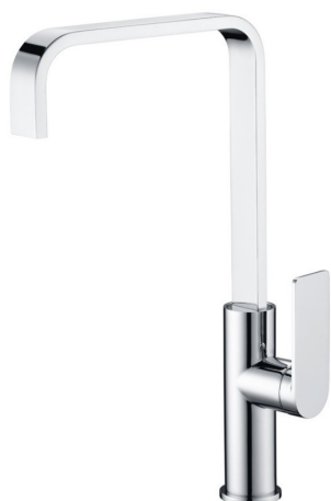
PBS1001 - RUKI Sink Mixer - Chrome