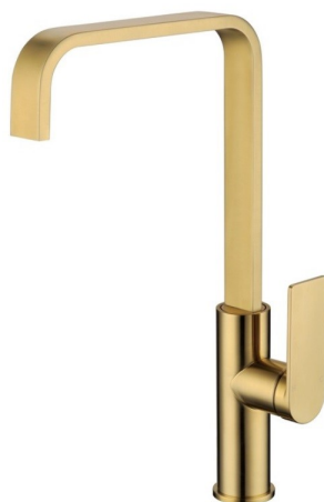
PBS1001BG - RUKI Sink Mixer - Brushed Gold