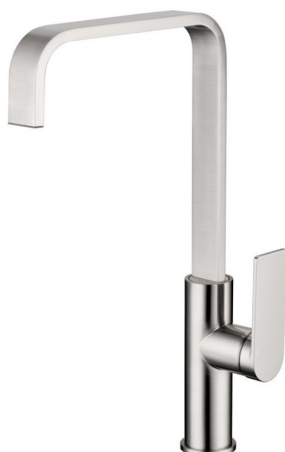
PBS1001BN - RUKI Sink Mixer - Brushed Nickel