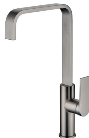
PBS1001GM - RUKI Sink Mixer - Gunmetal