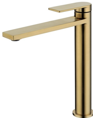
PBS2002BG - RUKI High Rise Basin Mixer - Brushed Gold