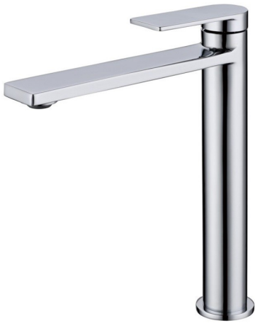
PBS2002 - RUKI High Rise Basin Mixer - Chrome