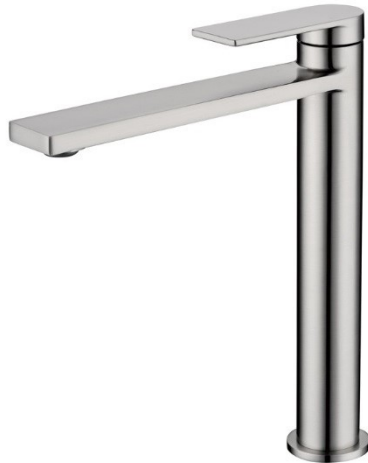
PBS2002BN - RUKI High Rise Basin Mixer - Brushed Nickel