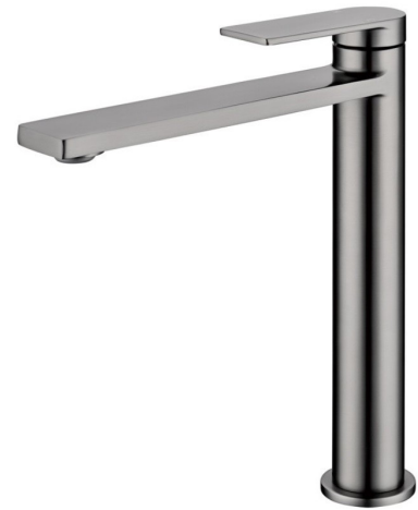
PBS2002GM - RUKI High Rise Basin Mixer - Gunmetal