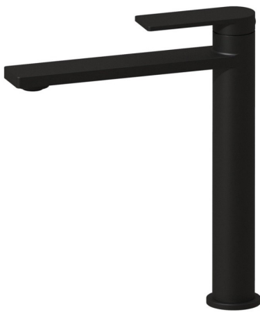
PBS2002MB - RUKI High Rise Basin Mixer - Matt Black