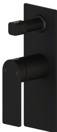
PBS3002MB - RUKI Wall Mixer with Diverter - Matt Black