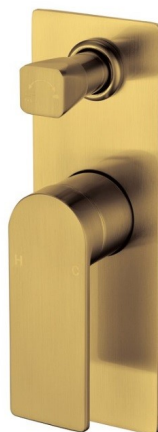
PBS3002BG - RUKI Wall Mixer with Diverter - Brushed Gold