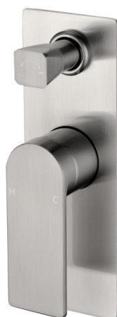
PBS3002BN - RUKI Wall Mixer with Diverter - Brushed Nickel