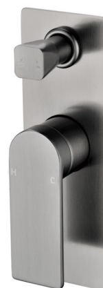
PBS3002GM - RUKI Wall Mixer with Diverter - Gunmetal