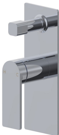
PBS3002 - RUKI Wall Mixer with Diverter - Chrome