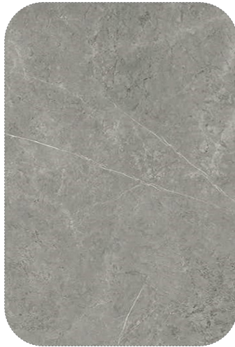
Concrete (Matt) (PORCELAIN)