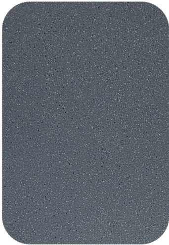
Volcanic Grey (Gloss) (SINTERED STONE)